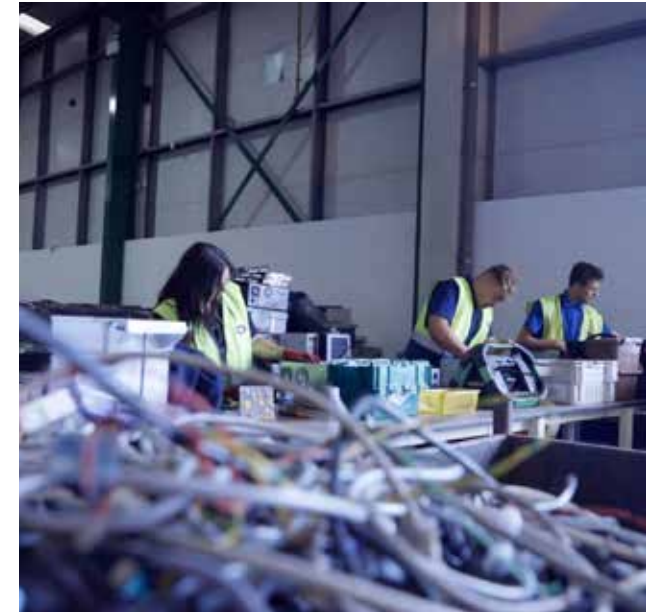
Figure 1: Indicative WEEE managed by S2S Group

It is S2S Group's responsibility to handle the management and disposal of IT and Mobile equipment in a safe, secure and professional manner, whilst making a positive impact on our environment and reducing the amount of e-waste that is illegally deposited in landfills.