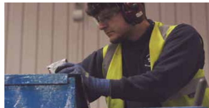
Figure 4: Hard drive destruction