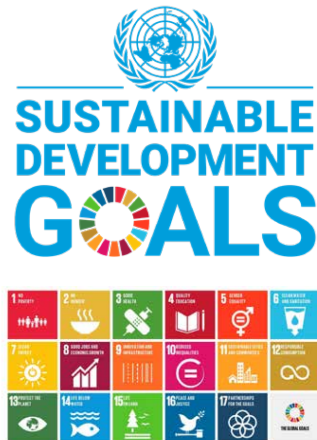
Figure 6: United Nations Sustainable Development Goals

These goals will be achieved through S2S Group's policies on human rights, modern slavery and their supply chain and by advancing the recovery and refurbishment of IT and mobile phones. Listed below are out high level commitments and measurable targets for each of the three priority goals.