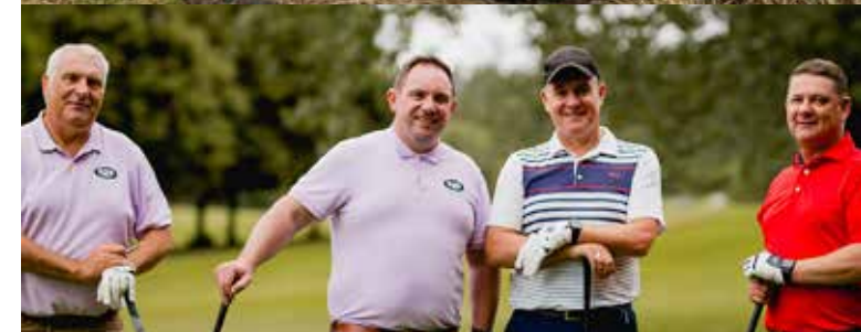
Figure 5: Local community and charitable engagement